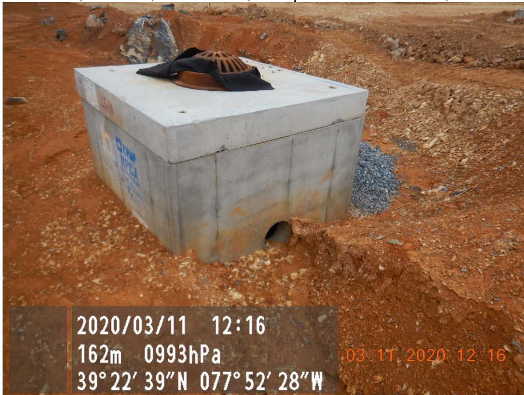
Drop inlet with out protection on side after maintenance was performed. Was immediately corrected upon notification.