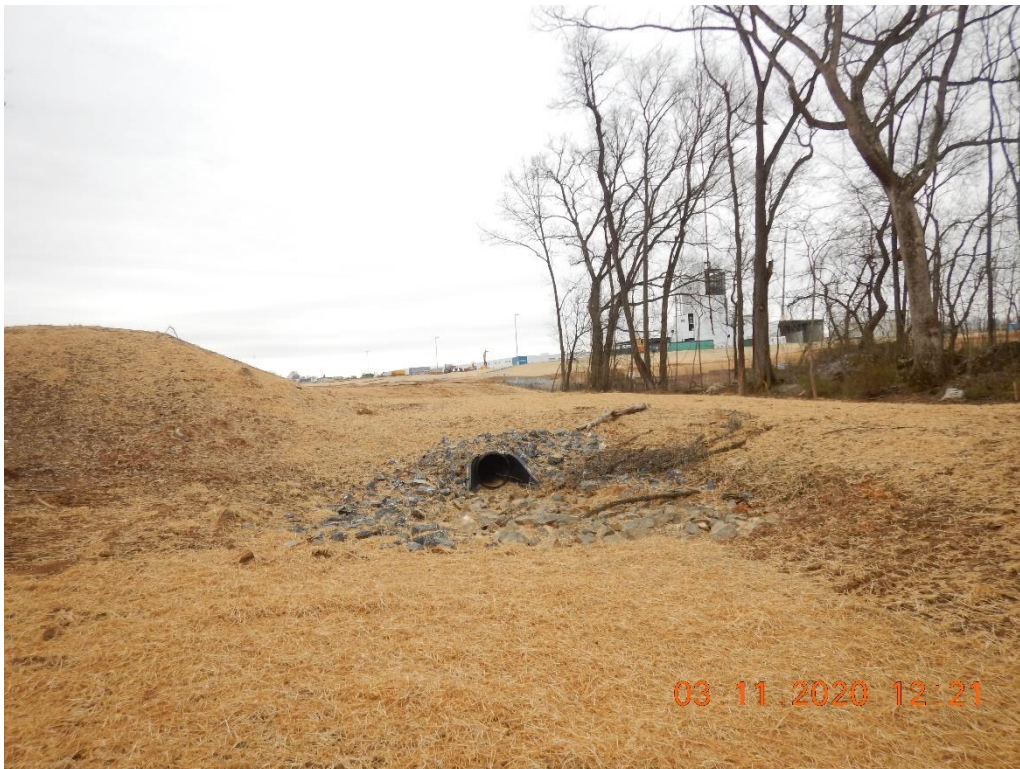
Outlet marker was not place at outfall of basin 1 yet. They are being made and will be posted within the next 24 hrs.