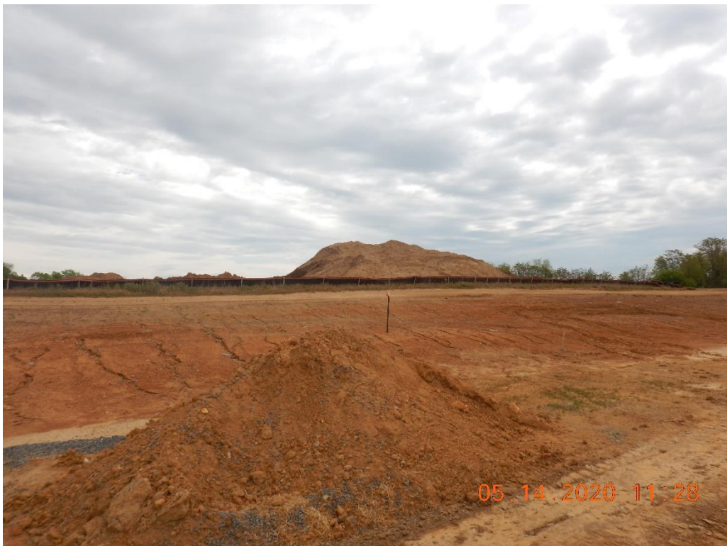
Stockpile area has not germinated within 30 days after seeding.