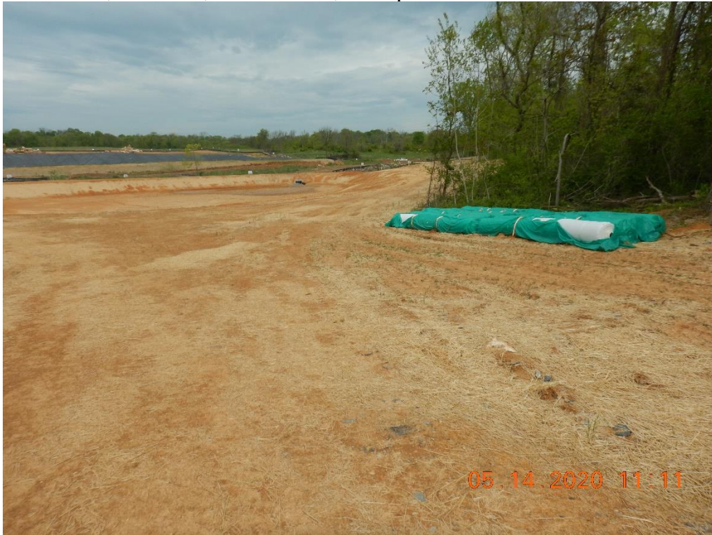
Basin area has not germinated within 30 days after seeding.